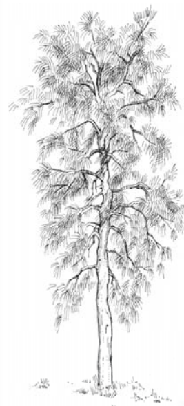
Peuce is a Greek word meaning pine